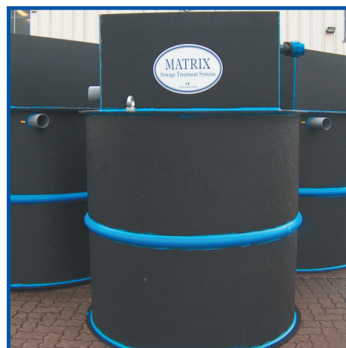
CLF1 - 6pe Treatment Plant ready for delivery.