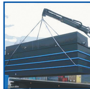
CLF9 - 70pe Treatment Plant being Loaded.