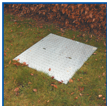
CLF1 - 6pe Fully Installed.

The MATRIX treatment system is a three stage biological process contained within a single tank structure, based on the principles of a submerged bed reactor and designed in accordance with the requirements of BS6297. Careful configuration of the internal flowpath and the inclusion of non-mechanical recirculation systems ensures optimal process performance as demonstrated by the exceptional results obtained from the independent testing, providing complete peace of mind for the end user. There are NO electrical or mechanical components within the treatment plant thereby eliminating the need for any specialist servicing arrangements ensuring that any maintenance requirements on the MATRIX system are kept to an absolute minimum.